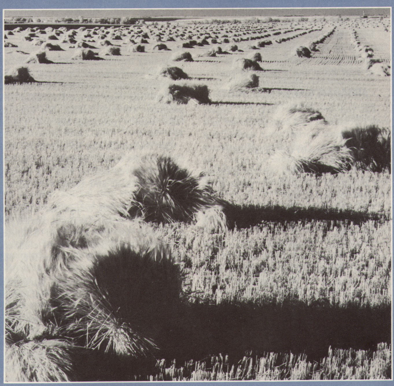
The Fathers of the Promises