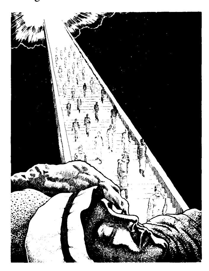
Using a stone for a pillow, the weary Jacob dreamed of a huge stairway descending from heaven.